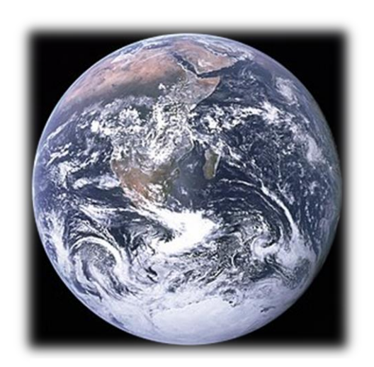
"The Blue Marble" Apollo Photo, 1972