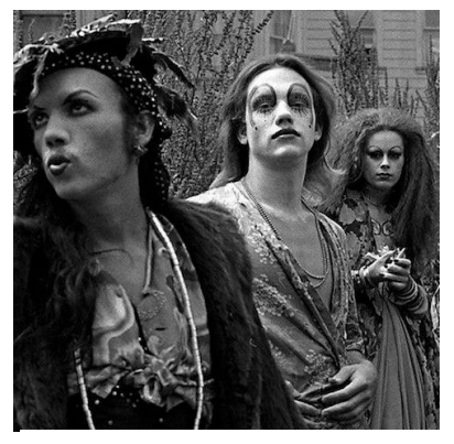
"The Cockettes," 1970.

April 23: Sexual Politics will begin by considering the works from 1970 that popularized the slogan that "sisterhood is powerful." We will discuss how the women's movement sought to raise our collective consciousness. We will take note of other 1970 works such as Kate Millett's Sexual Politics and Our Bodies, Ourselves, which arose from feminist consciousness-raising groups that used the self-help course Women and Their Bodies. These efforts set the stage for the first gay pride marches in 1970 that GLBTQ people organized to make their presence known. We will consider the impact of the "gay liberation" by referencing Time magazine cover articles from 1969 and 1979, and we will also discuss the challenges to 2<sup>nd</sup> wave feminism posed by black feminists.