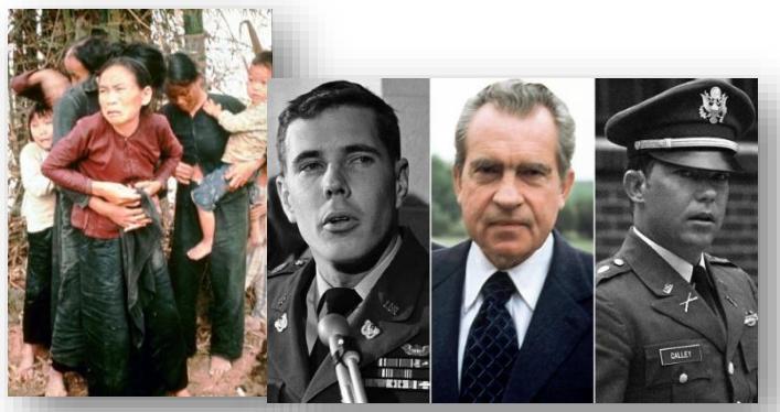
My Lai Massacre, 1969 and Nixon and the Coverup, 1970